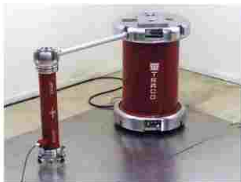
Single-stage AC Voltage Test Set-up