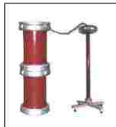
2-stage AC Voltage Test Set-up