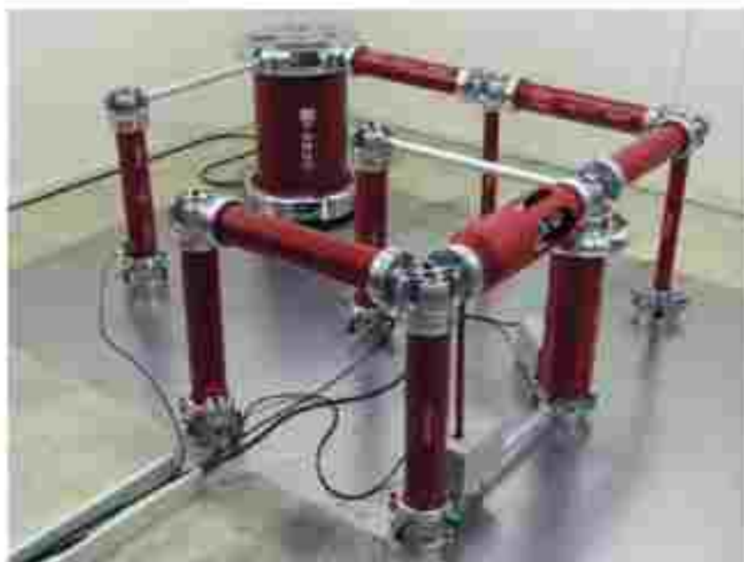
Single stage Impulse Voltage Test Set-up (In the picture above AC-divider + Connecting Rod incl.)