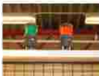
Green & Red Lamps