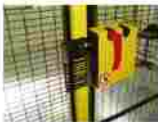
Safety Door Lock

Aluminum floor (8sqm) comprising: 4 pcs aluminium sheets 2000 x 1000 x 2mm Set of Cables and Screws.