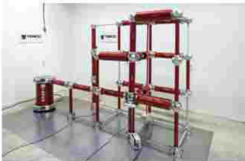
3-stage Impulse Voltage Test Set-up