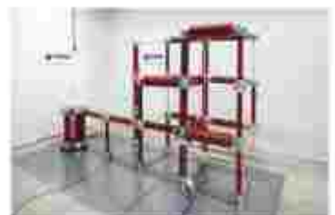
3-stage DC Voltage Test Set-up