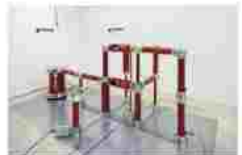
2-stage Impulse Voltage Test Set-up