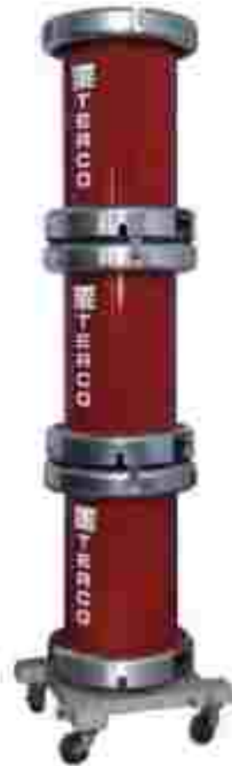
Three HV9105 connected in cascade