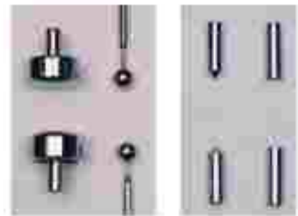
Flat and 20 mm Sphere Electrodes

Max. operating pressure (abs): 0-6 bar Height approx 800 mm Weight 12 kg