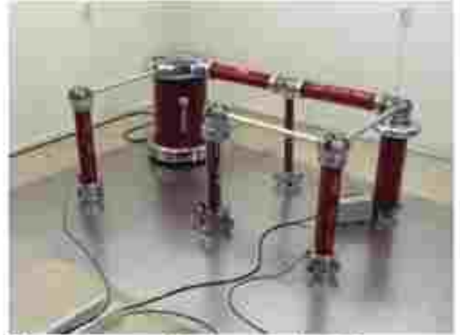
Measurement of flashover voltage in vacuum and under pressure