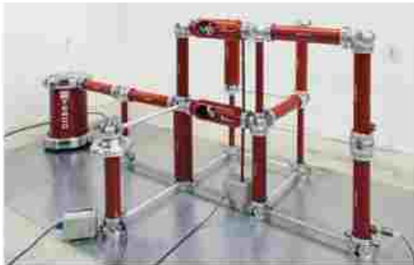
2-stage Impulse Voltage Test Set-up