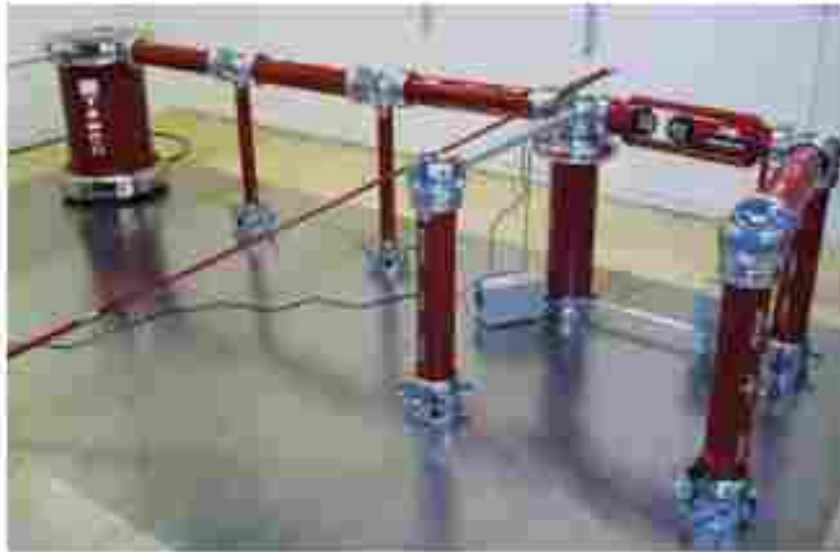
Single-stage Impulse Voltage Test Set-up Discharger Rod on the Capacitor