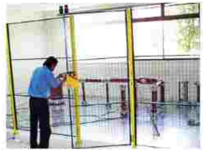
Installation of Safety Fence