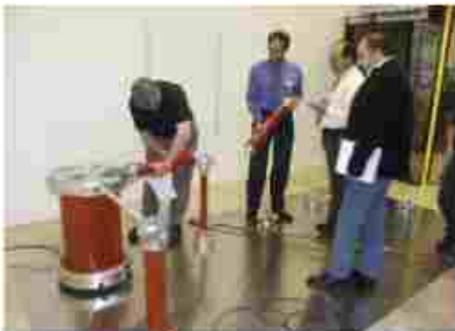
Demonstrating easy assembly