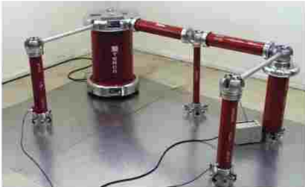
Single-stage DC Voltage Test Set-up (In the picture above AC-divider + Connecting Rod incl.)