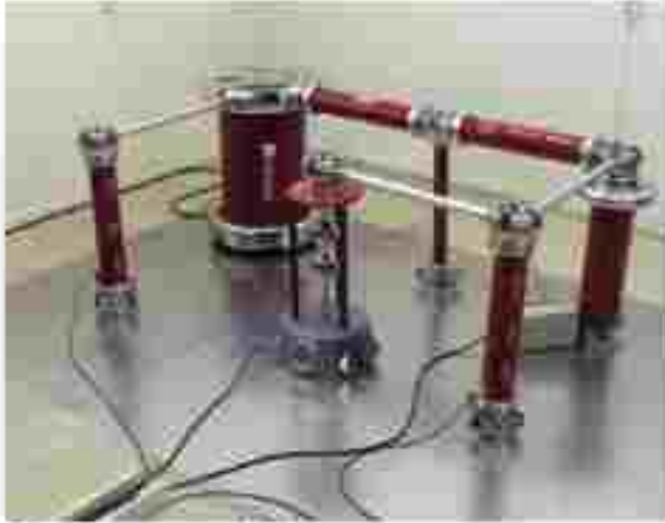
Measurement of flashover