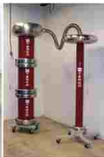
3-stage AC Voltage Test Set-up